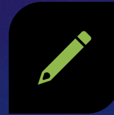
SPANISH II (MUST HAVE INSTRUCTOR'S SIGNATURE)